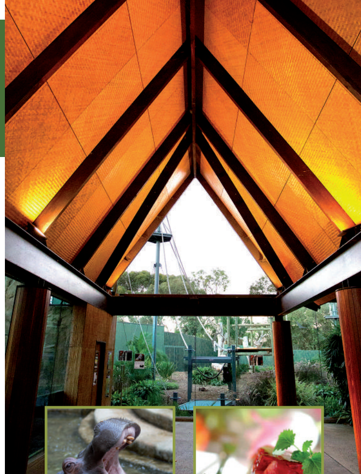
Fig Tree Function Centre Ph: 08 8267 2650 qualitycatering.com.au