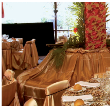
FIG TREE FUNCTION CENTRE