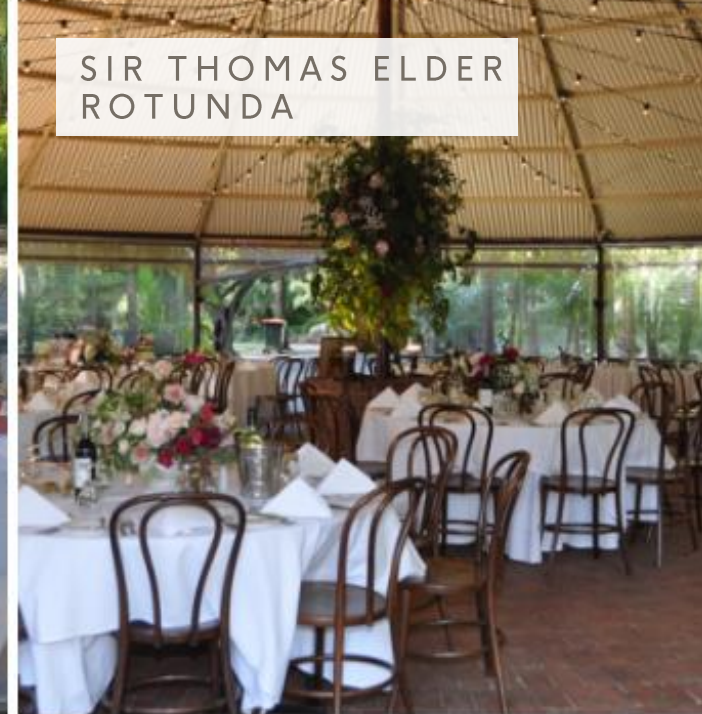
SIR THOMAS ELDER ROTUNDA